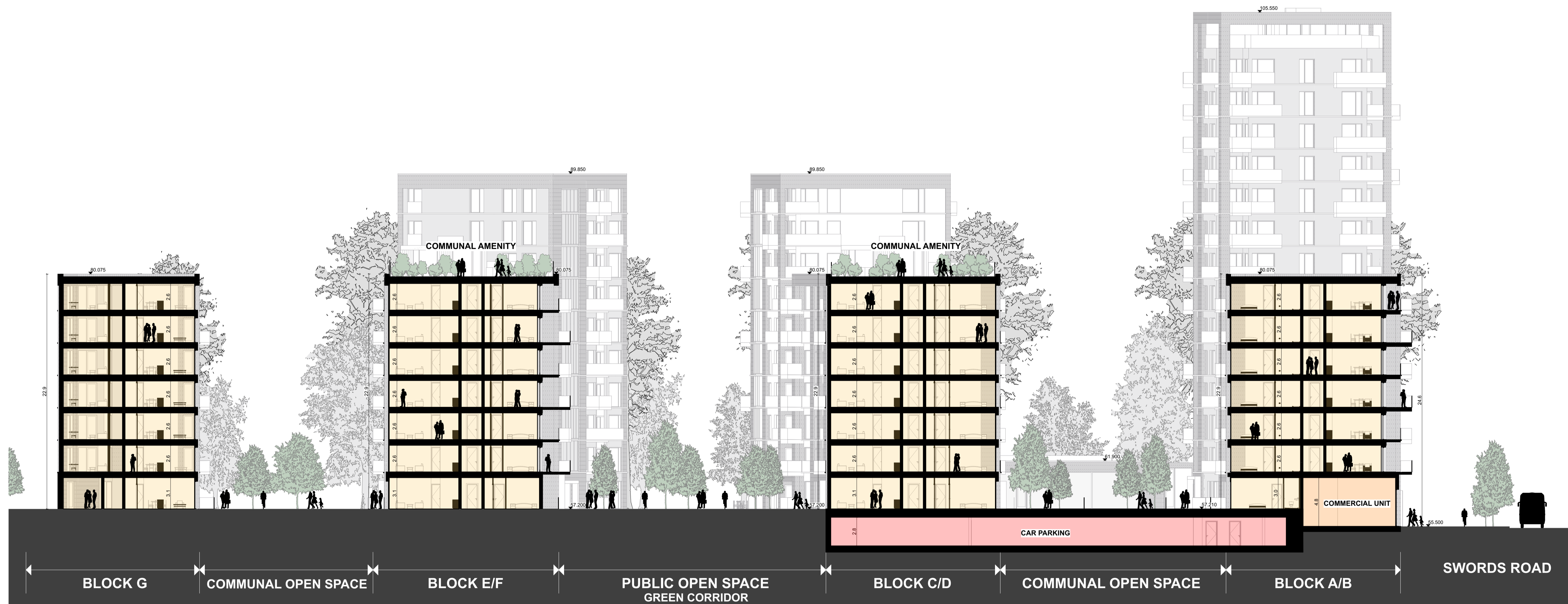
Section K-K SCALE : 1:200